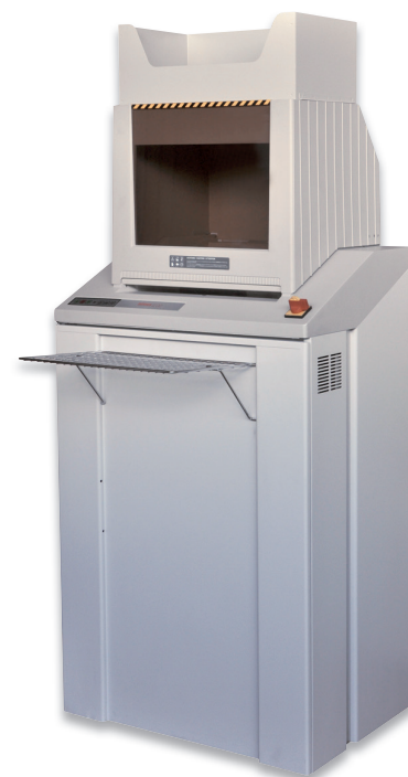
W/D/H 75 x 55 x 180 cm