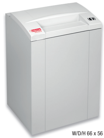
W/D/H 66 x 56 x 105 cm

Professional Data Shredders – a Synthesis of Technology, Performance and Design. All intimus® shredders are built from durable, precision engineered, high-performance components, designed for a long life of high volume usage. The product range covers all requirements from day-to-day office use up to High Security Shredding machines in use for destruction of classified material in line with all current legal requirements such as DIN 66399 or NSA 02/01. intimus® shredders carry various features which make them unique in user-friendliness and operating efficiency.